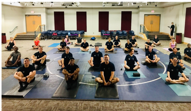
RPD Recruit Class

In the fall of 2017, RPD R2R members collaborated with the GRTICN Training Committee to provide trainings for officers on the Introduction to Trauma and Resilience. Approximately 300 officers attended in-service trainings. In December 2017, twelve RPD R2R members participated in a Trauma & Resilience Basics Train the Trainer workshop. RPD R2R trainers worked to modify this training and created a curriculum tailored for law enforcement officers. The training is entitled "Surviving and Thriving: Stress, Trauma and Resilience." This training includes the following topics: an overview of RPD R2R, stress and the impact of stress, trauma and the impact of trauma exposure, resilience and wellness strategies.