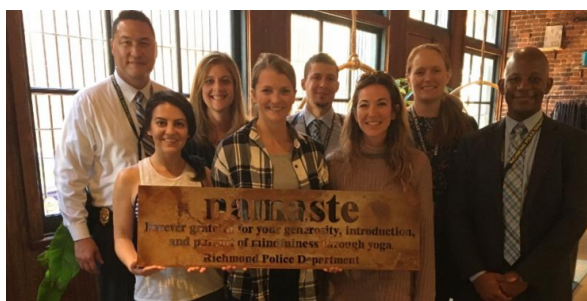
RPD R2R Members & Humble Haven Staff

RPD leadership embraced the challenge of implementing trauma-informed practice recommendations. The first eNote via e-mail in December 2016 provided information about trauma exposure and resilience building. Following this eNote, in January 2017, the RPD Wellness Project was formed and members organized a free yoga class with Humble Haven Yoga Studio.